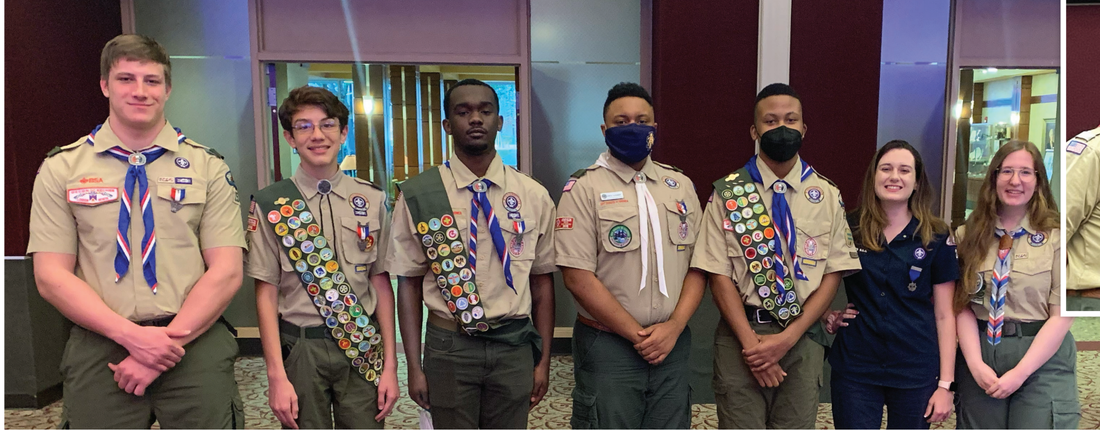
Pictured above is the Color Guard of Eagle Scouts for the 2022 Eagle Banquet.