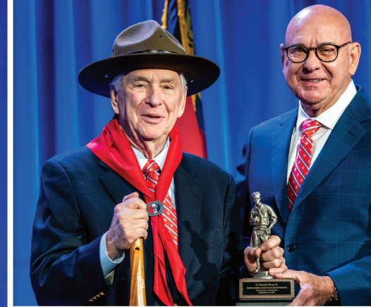
Over 100 Scouts in uniform surrounded the stage for the Color Guard at this year's luncheon.

A RECORD YEAR FOR FRIENDS OF SCOUTING $2.2 million raised | 1700 attendees