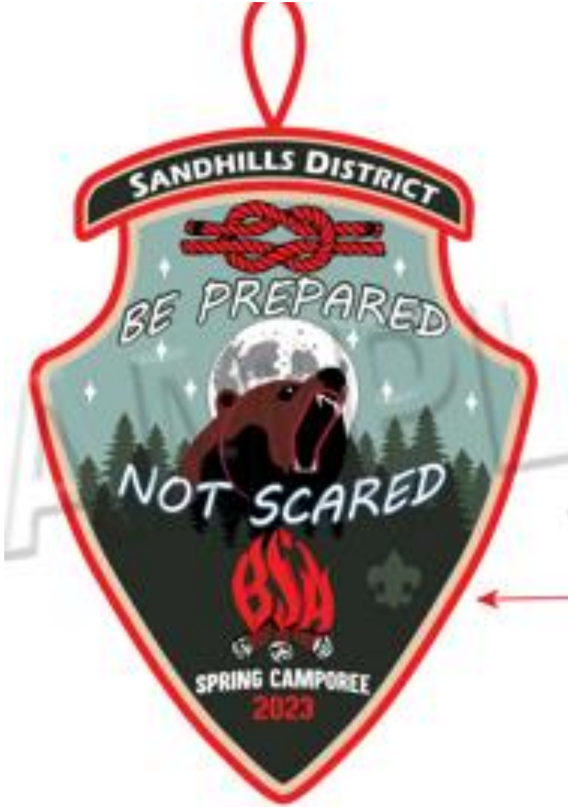
Camporee patch (Not Actual Size)